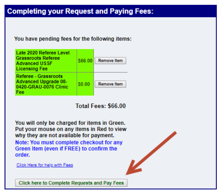
Step 3 of 3: Checkout to pay the Associated Fees

The website will show you a receipt for the clinic and also email you a receipt. The receipt contains the address and the clinic session times.